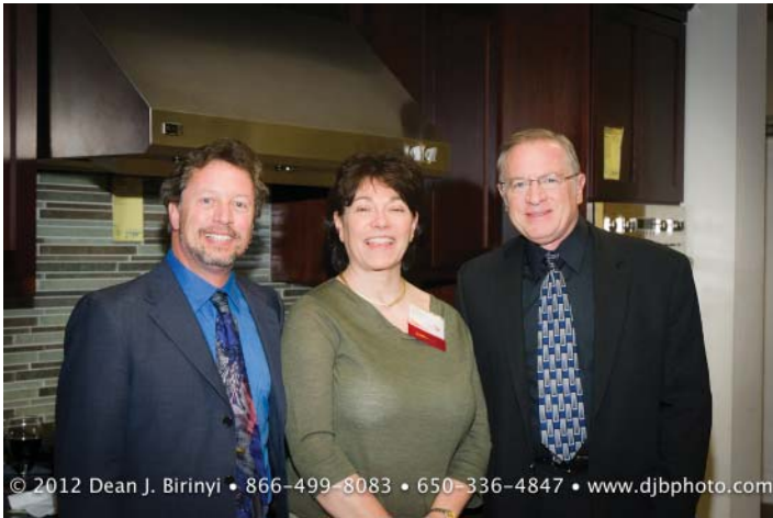
Photo Highlights of our Chapter Event